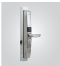
ADAMS RITE A100