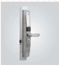
ADAMS RITE A100